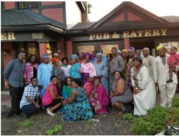
Retirement Celebration @ Fumi Restaurant - June 2018